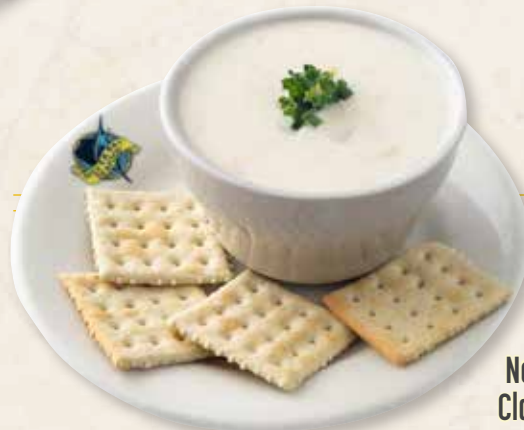
New England Clam Chowder

We do our best to remove all bones from the fish, however we cannot guarantee the fillets will be boneless. Also be aware that occasionally the oysters may have pearls or shells in them.