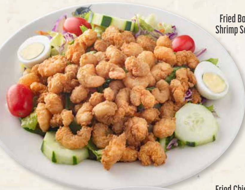
Fried Baby Shrimp Salad