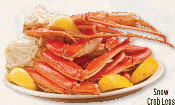
Snow Crab Legs