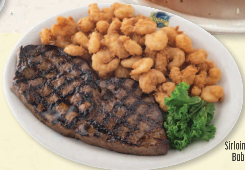
Sirloin Steak and Baby Shrimp

Broiled Grouper & Fried Jumbo Shrimp - 18.45