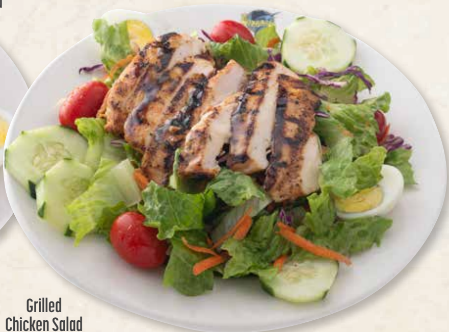
Grilled Chicken Salad