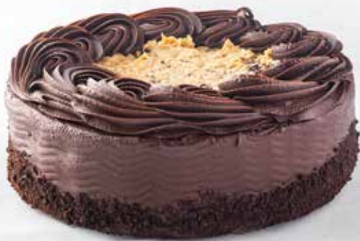
German Chocolate Cake