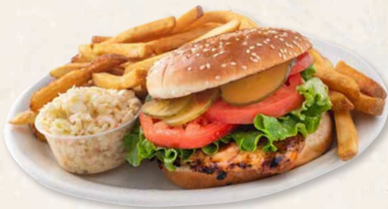
Grilled Chicken Sandwich

Served with homemade potato chips and coleslaw - 11.99