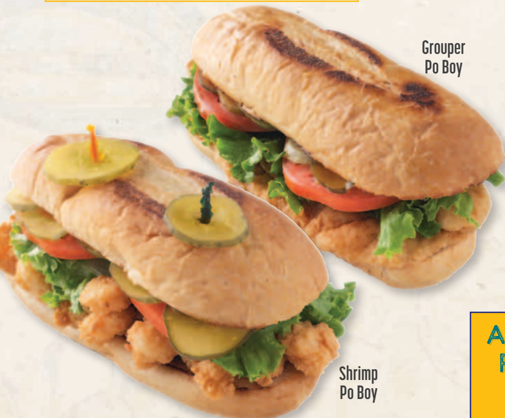
Grouper Po Boy