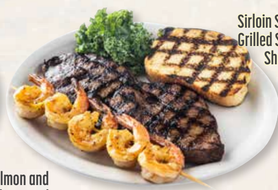
Sirloin Steak and Grilled Skewered Shrimp