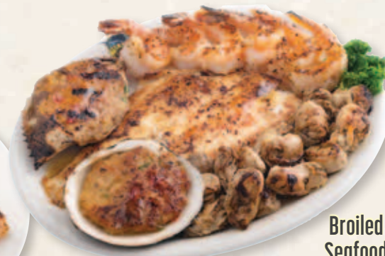
Broiled Seafood Platter

SMOTHERED CHICKEN With onions, peppers, mushrooms and provolone cheese - 14.95