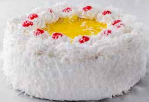
Coconut Pineapple Cake

WHOLE CAKES ARE AVAILABLE FOR SPECIAL EVENTS!