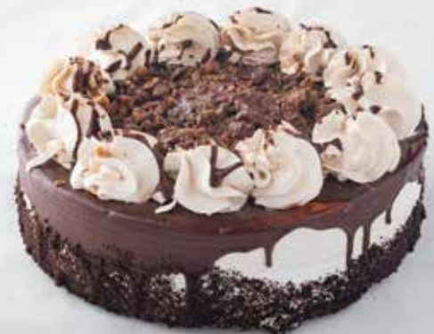
Peanut Butter Cake