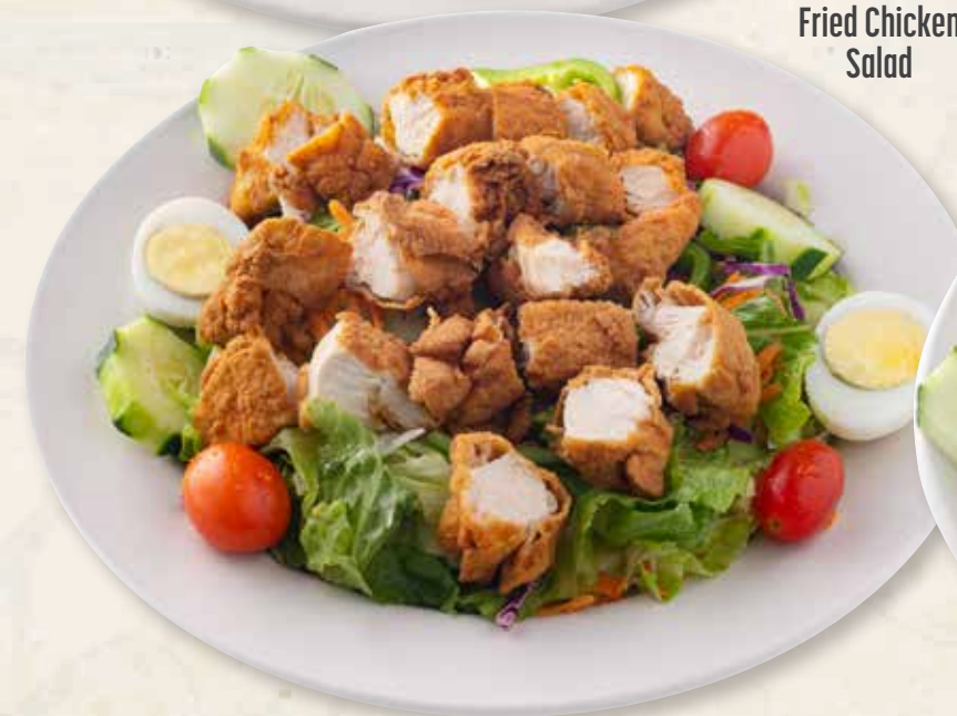
Fried Chicken Salad