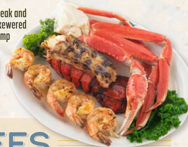
Lobster Tail, Crab Legs and Grilled Shrimp