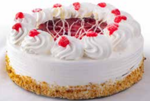
Strawberry Shortcake Cake