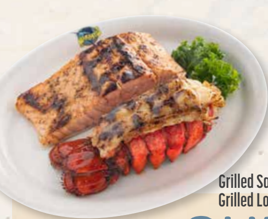
Grilled Salmon and Grilled Lobster Tail